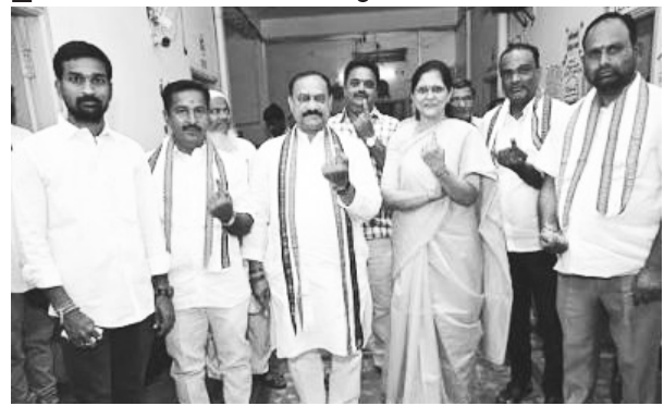
Sangareddy (Telangana), June 23 (UNI)