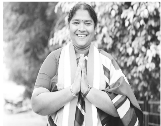
Hyderabad, June 23 (UNI)